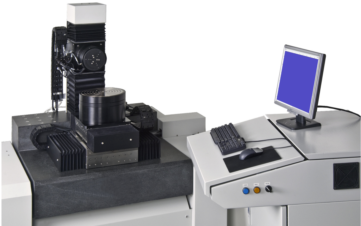
The ABTech 5 axis air bearing motion system incorporates six ultra-precision ABTech manufactured air bearings providing five axis of motion, each with direct drive motors and high resolution encoders.