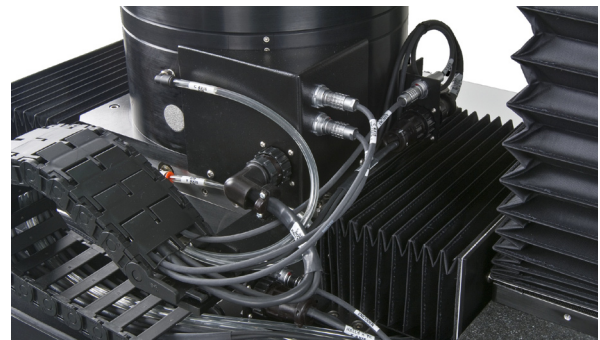
Close up view of 5 axis air bearing motion system from ABTech