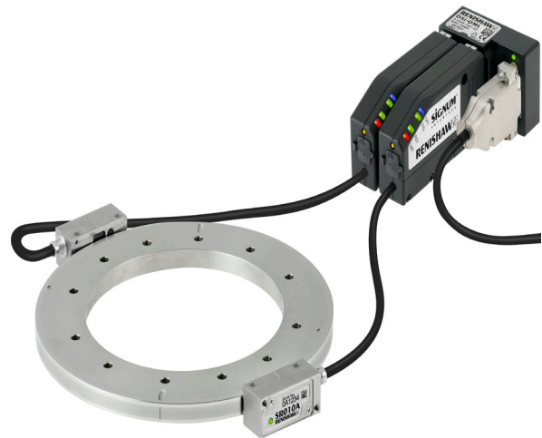
DSi and REXM ultra-high accuracy encoder system.

When a leading manufacturer of CNC optical manufacturing technology needed ultra-accurate and stable positioning for a new system for measurement of conformal optics, it turned to ABTech Manufacturing Inc, specializing in custom-made ultra-precision air bearings and motion systems. To meet tighter customer specifications for positioning resolution, it found the solution, as usual, in new high-resolution linear and rotary optical encoders from Renishaw. The East Swanzey, New Hampshire company created a five-axis optical measurement platform featuring three ABTech linear air bearings, two ABTech rotary air bearings, and Renishaw's ultra-high accuracy SiGNUM™ series linear and rotary encoders.