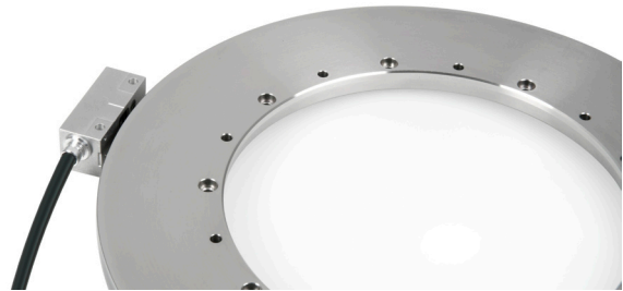
REXM stainless steel ring