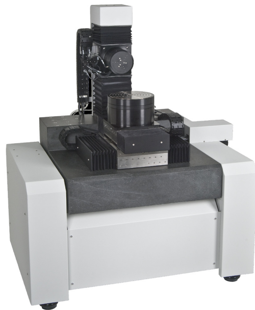
ABTech 5 axis optical metrology station

The one-piece REXM stainless steel ring is available with diameters from 2.047 to 16.417 inches and has scale graduations marked directly onto the outer periphery. The integral ring/scale locks directly to the rotor, eliminating reversal errors, coupling losses, oscillation, shaft torsion and other hysteresis errors that plague enclosed encoders.