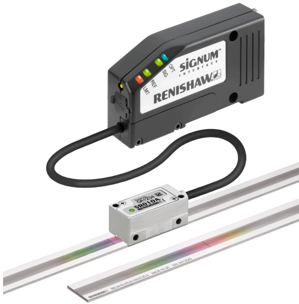
SiGNUM™ RELM high accuracy linear encoder system